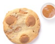
DULCE DE LECHE