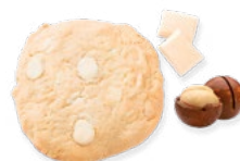
WHITE CHOCOLATE & MACADAMIA NUTS