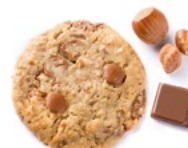
MILK CHOCOLATE & HAZELNUTS