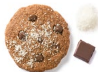
COCONUT & DARK CHOCOLATE