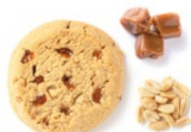
PEANUTS & CARAMEL