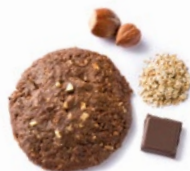
CHOCOLATE, OATS & NUTS