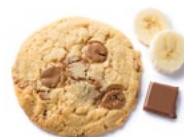
MILK CHOCOLATE & BANANA