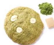
ORGANIC WHITE CHOCOLATE & MATCHA TEA