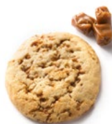
SALTED BUTTER CARAMEL*