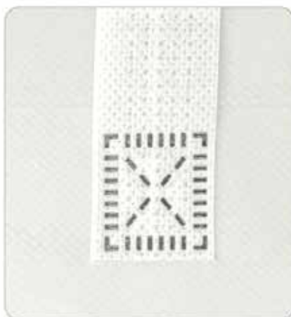
Portable tape handle