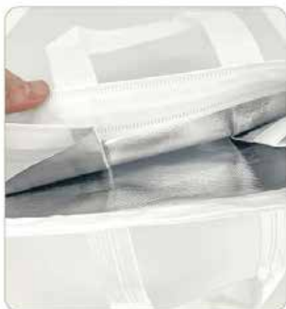
Internal insulation layer