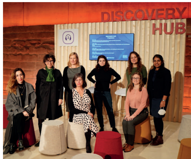
WomenEntrepreneurs4Good 2021 promotion