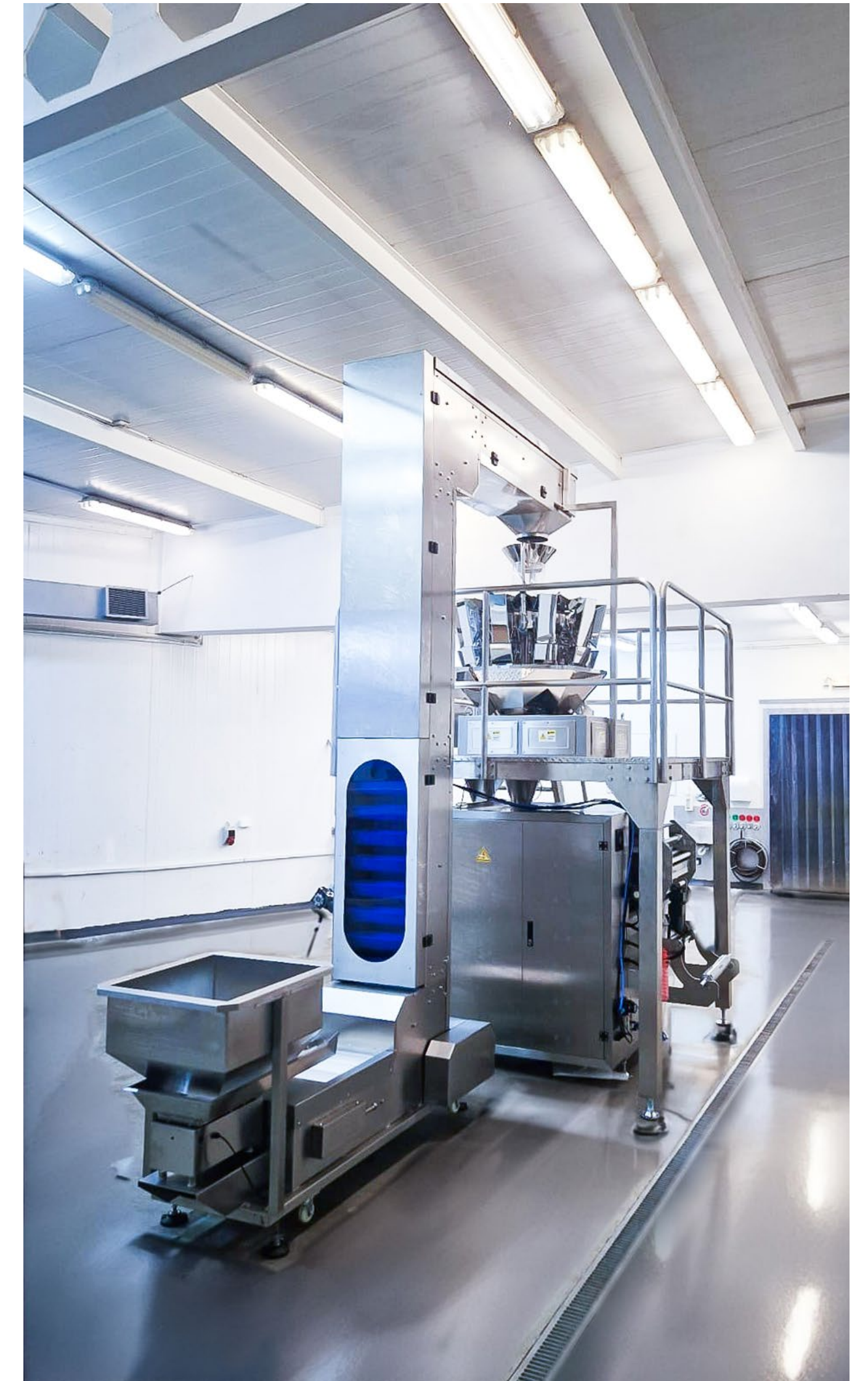
Production facility in Kartuzy - Poland