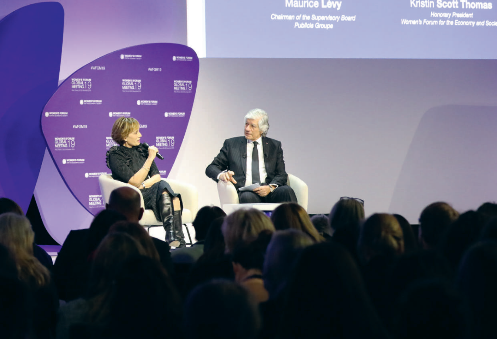
Kristin Scott Thomas, Maurice Lévy

Honorary President Women's Forum for the Economy and Society