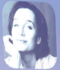
Kristin Scott Thomas

Chairman of the Supervisory Board Publicis Groupe