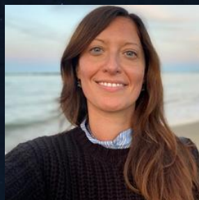
Piera TORTORA OECD