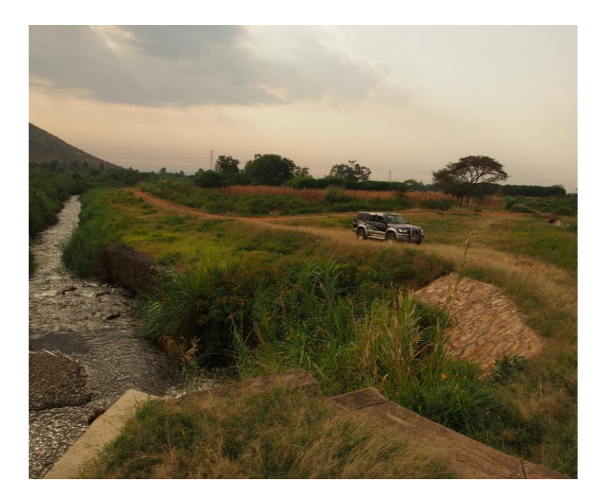
Water demand (left) and irrigation canals (right) in Mubuku, Kasese, Uganda_