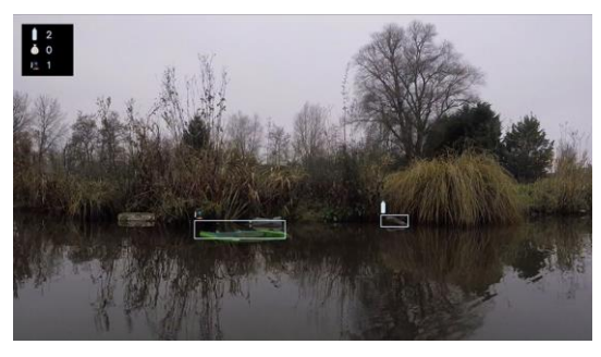
The detection of the waste is carried out by the Al in a second time