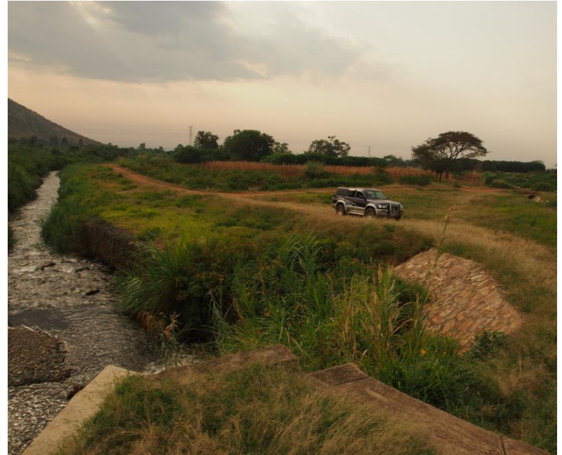
Water demand (left) and irrigation canals (right) in Mubuku, Kasese, Uganda