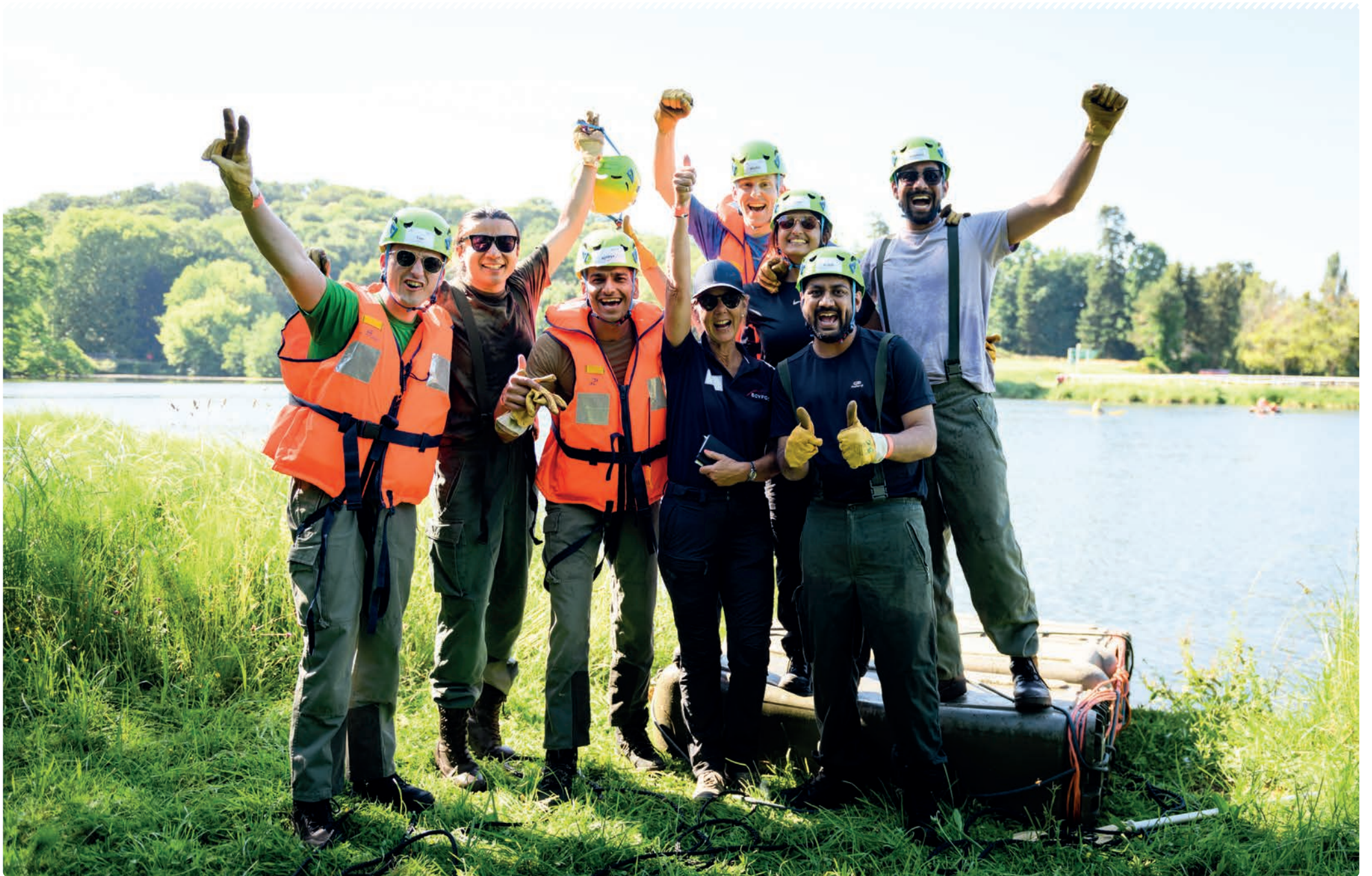
Outdoor Leadership Seminar: Leadership training requires a rigorous combination of academic theory and learning-by-doing. We teach the theories behind leadership, then provide the ideal environment to put those theories to the test.