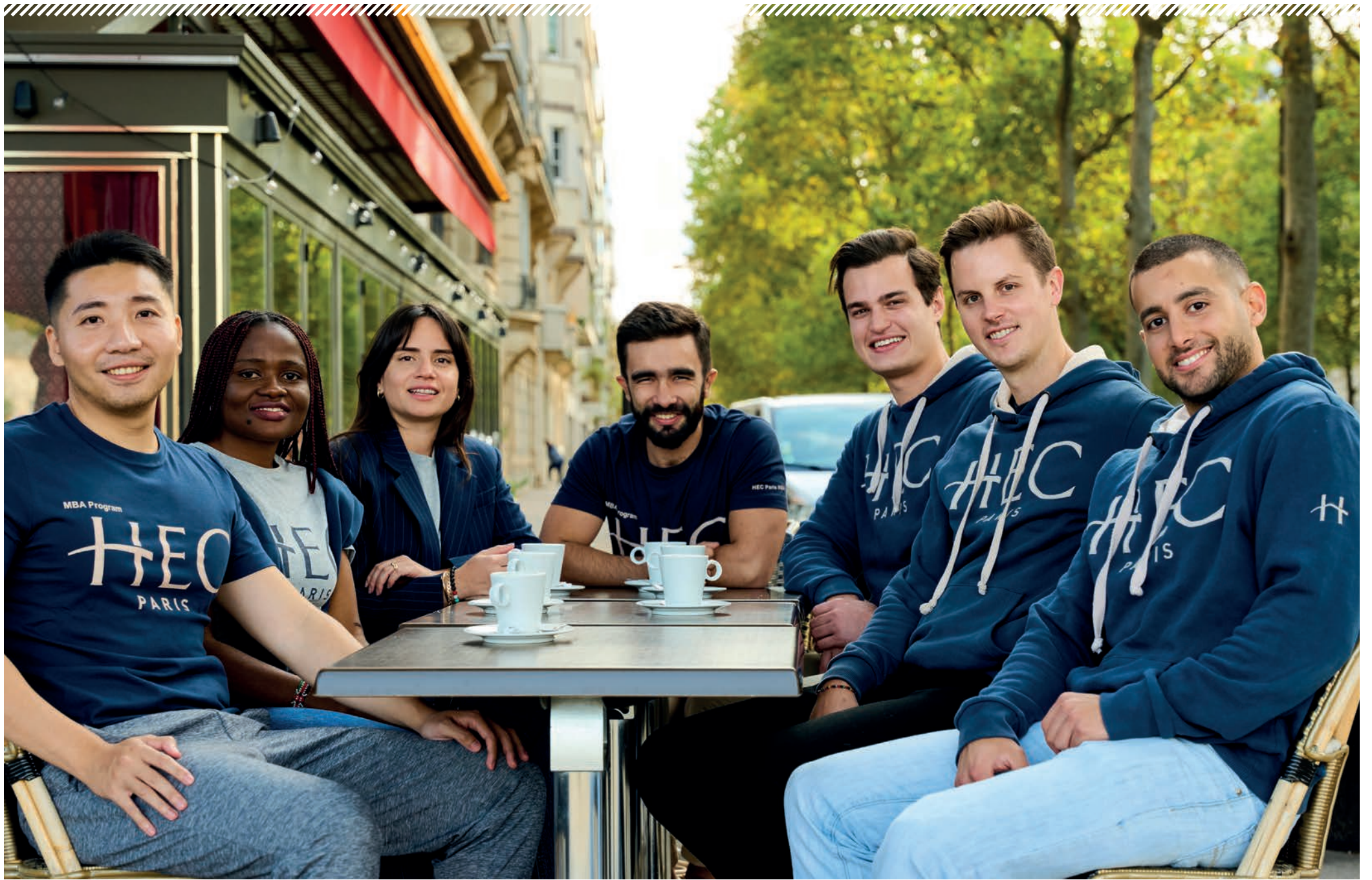
The majority of HEC Paris MBA students live in our on-campus housing, allowing you to form a close-knit community for life.