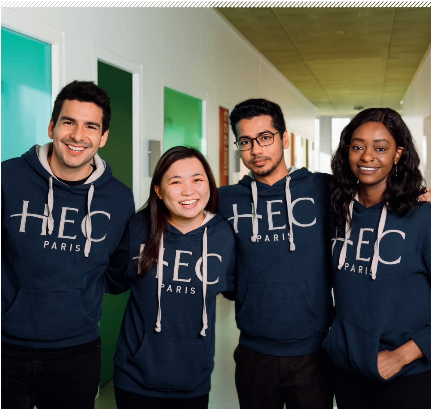
Our MBA clubs organize a wide range of on-campus speakers and workshops , including ones specifically designed to connect and empower our female students.