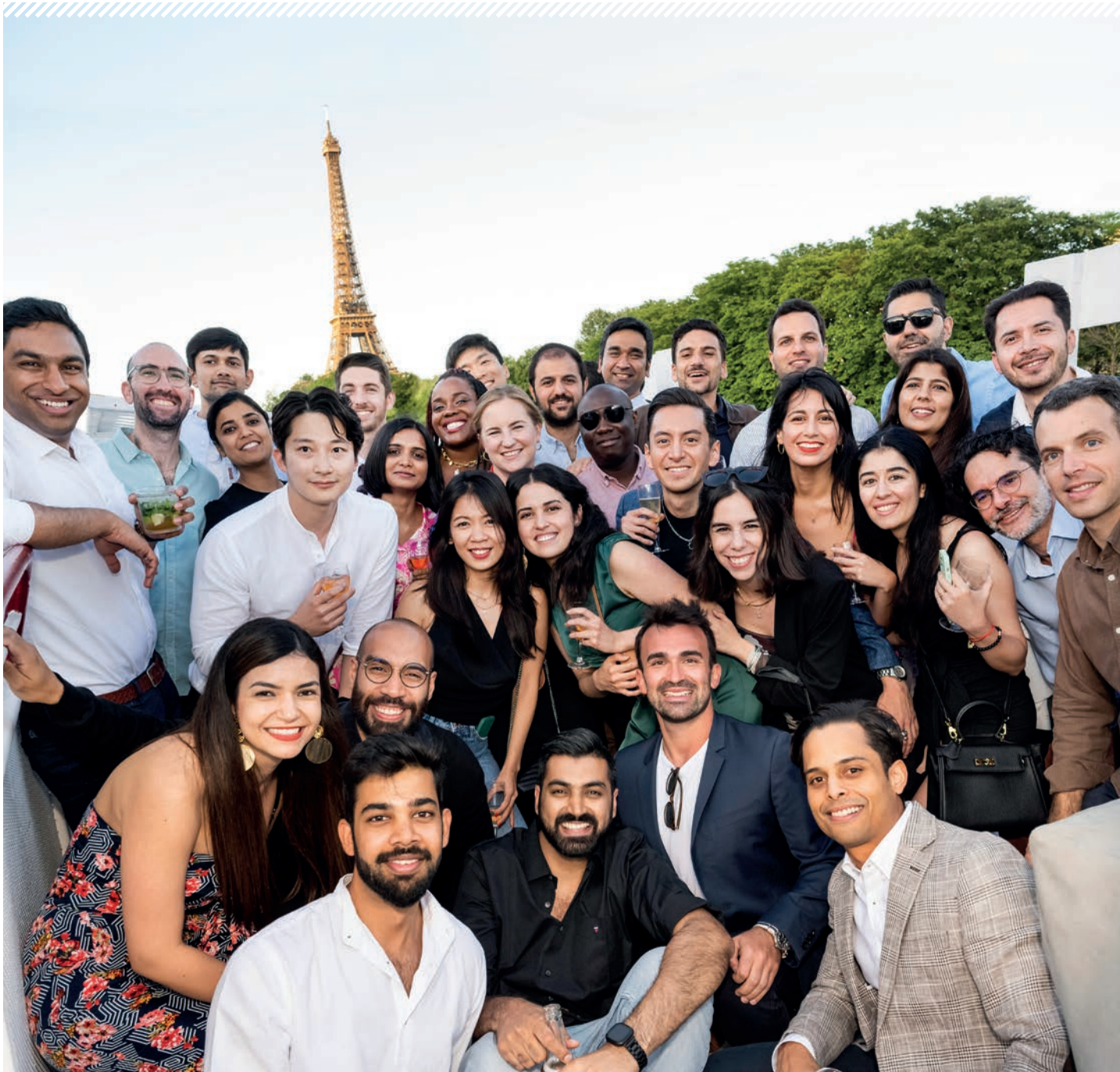
Our students benefit from an extensive alumni network , made up of more than 70,000 professionals from 150 countries .