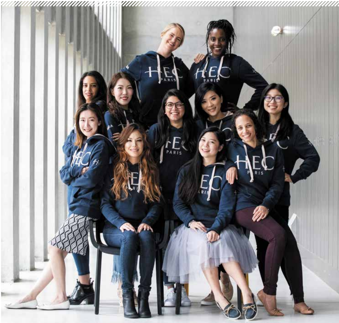
Our MBA clubs organize a wide range of on-campus speakers and workshops , including ones specifically designed to connect and empower our female students.