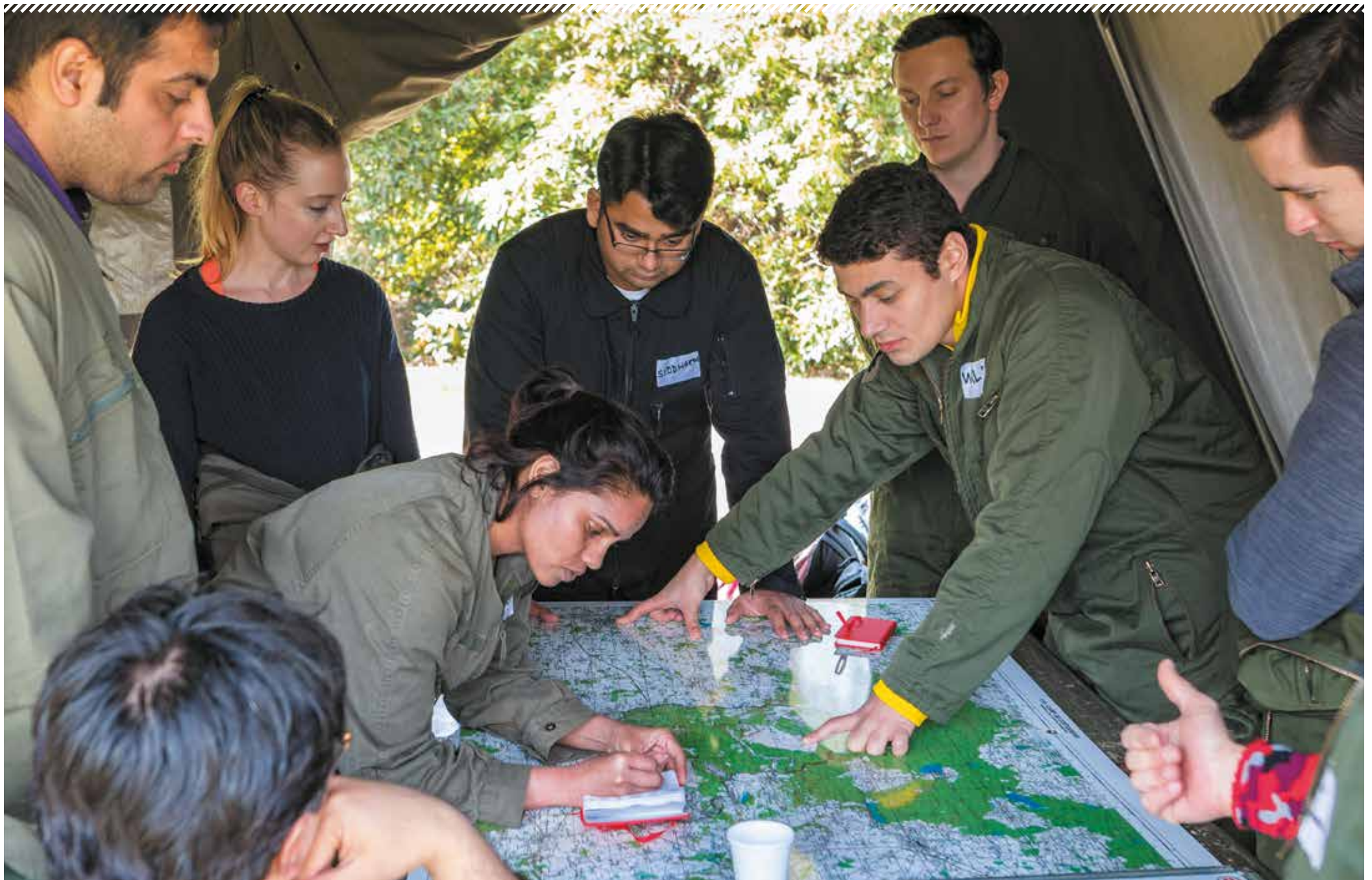
Outdoor Leadership Seminar: Leadership training requires a rigorous combination of academic theory and learning-by-doing. We teach the theories behind leadership, then provide the ideal environment to put those theories to the test.