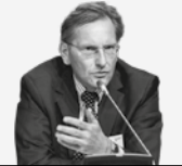
Marc van der Woude General Court of the European Union