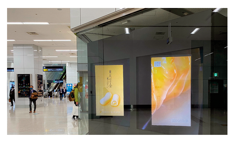
Expand your store's footprint and draw traffic by beaming holographic images and videos outside in the street or walkways like this display at Haneda Airport in Japan.

According to a report by Market Research Future, the global digital holography market is predicted to reach approximately $7.5 billion by the end of 2023.