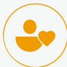
L&D TEAM GALIAN

Each time I come back with elements directly applicable. Bravo also for facilitation and pedagogy.