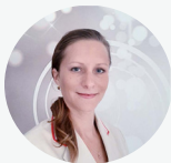
FRANCE V. URGO

Reliable and efficient partner for hosting live digital events.