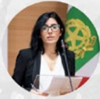
Ms. Fabiana DADONE Minister of Youth, Italy