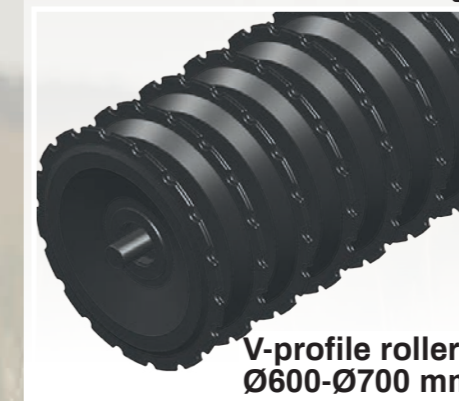
V-profile roller Ø600-Ø700 mm

The Star Roller increases drainage, consolidates the soil and leaves it loose.