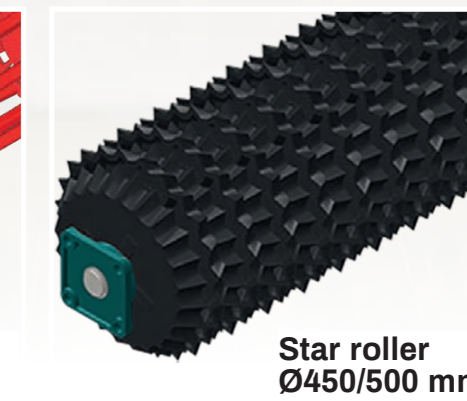
Star roller Ø450/500 mm