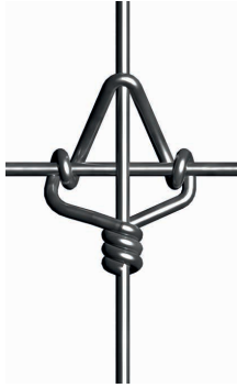
Antisliding fixed knot