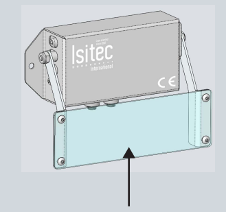
The dimension of the door is adjustable