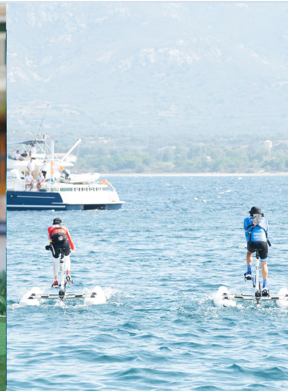
CROSSING CALM - MONACO