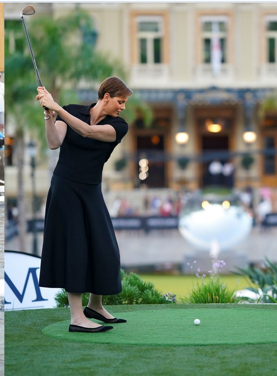
PRINCESS OF MONACO CUP GOLF TOURNAMENT