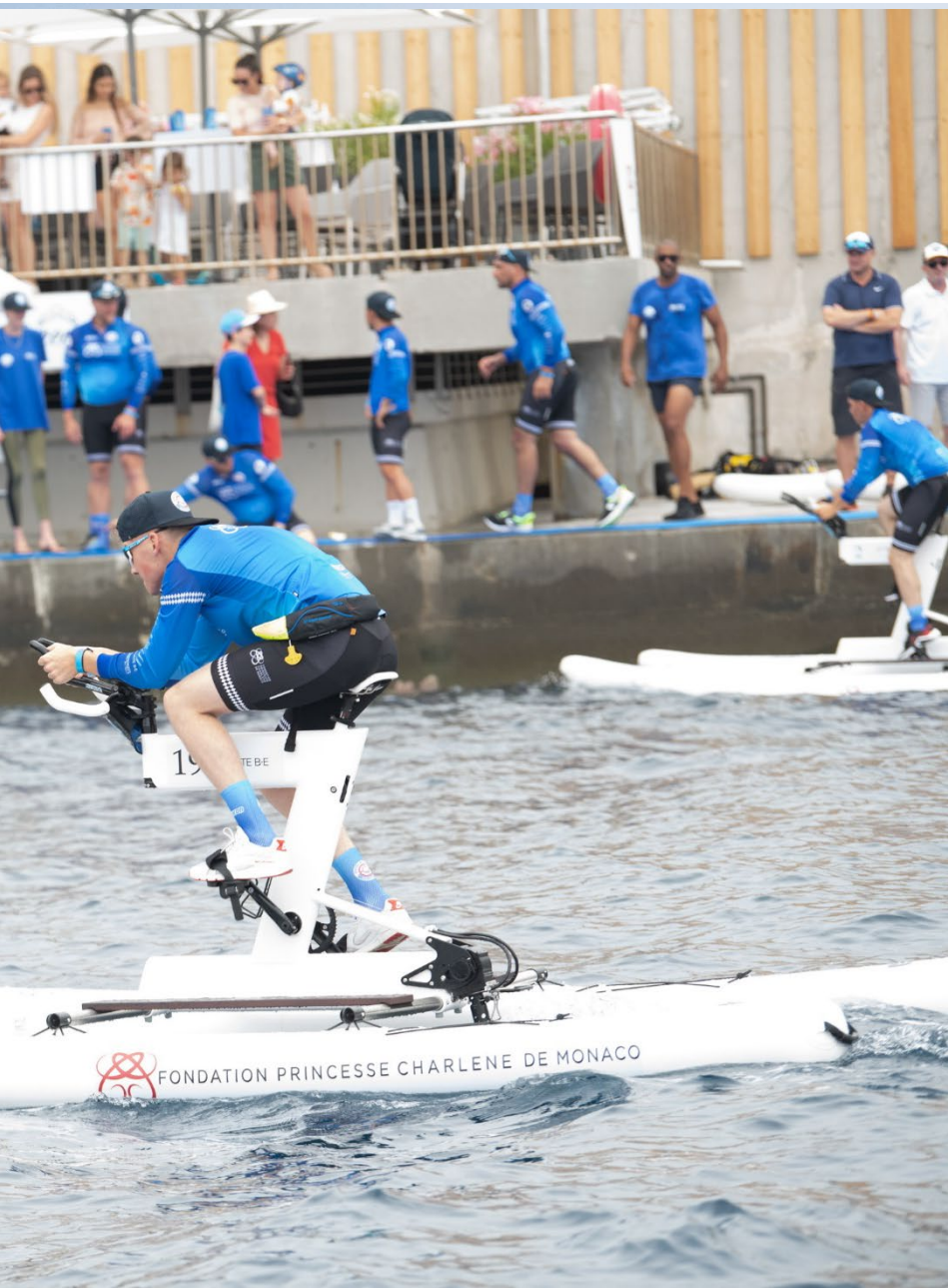
RIVIERA WATER BIKE CHALLENGE