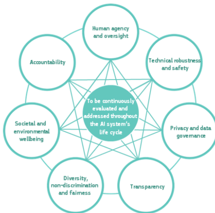
Figure 2: Interrelationship of the seven requirements: all are of equal importance, support each other, and should be implemented and evaluated throughout the AI system's lifecycle

While all requirements are of equal importance, context and potential tensions between them will need to be taken into account when applying them across different domains and industries. Implementation of these requirements should occur throughout an AI system's entire life cycle and depends on the specific application. While most requirements apply to all AI systems, special attention is given to those directly or indirectly affecting individuals. Therefore, for some applications (for instance in industrial settings), they may be of lesser relevance.