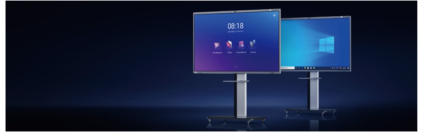
With the Intel chipset inside OPS module, it's a compatible Windows IFP.

- Windows module: Robust Intel chipset powers customized windows OS with Horion services inside. Horion services are now available and compatible in windows platform.