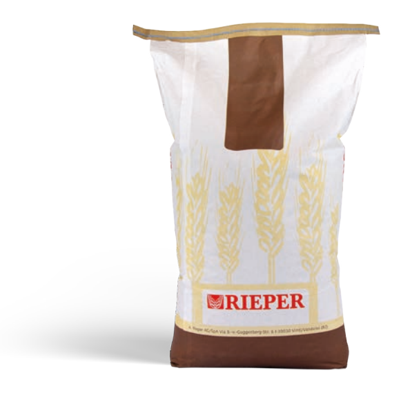
ITEM No. 0062 – 25 kg – FINE ITEM No. 0063 – 25 kg – MIDDLE ITEM No. 0060 – 25 kg – COARSE