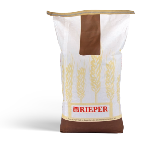
ITEM No. 0009 – 25 кg

This flour with a coarse granulation guarantees optimum liquid absorption without forming lumps. It also makes all potato dough specialities particularly fluffy. Due to its coarse grain size, it is also particularly suitable for liquid batters, as dusting flour and for binding sauces.