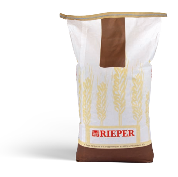
Ітем No. 0096 – 25 кg