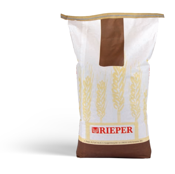
ITEM No. 0052 – 25 кg

Carefully selected soft wheat varieties are ground into this excellent flour after intensive cleaning. As the whole-grain including the germ is ground, this flour contains a lot of precious nutrients and is particularly rich in fibre. It is ideal in combination with flour types 0 and 00 to improve the nutritional value of baked goods.