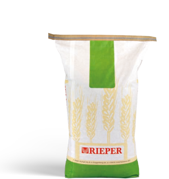
Ітем No. 0106 – 20 кg

This particularly dark type of flour is ideal for preparing aromatic and traditional types of bread with a unique flavour. It is also suitable for the preparation of starter doughs and sourdoughs.