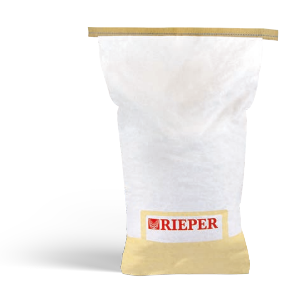
ITEM No. 0272 – 25 кg

Soft wheat flour type 00, baking ferment (wheat flour, dextrose, wheat ferment), malt flour (barley, wheat), brown sugar, vegetable oil (rapeseed), enzymes, L-ascorbic acid, salt, malt flour (wheat).