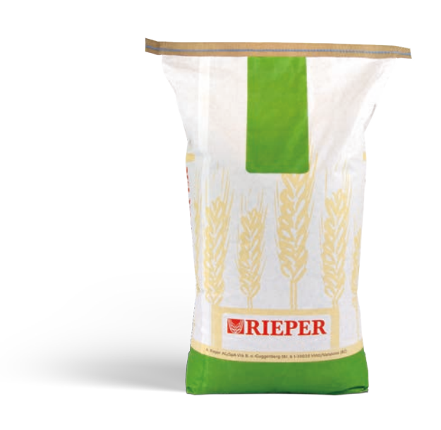
ITEM No. 0082 – 25 кg

This flour is a particularly light type of rye flour made predominantly from German rye and is particularly suitable for light rye doughs such as the typical South Tyrolean "Schüttelbrot" breads.