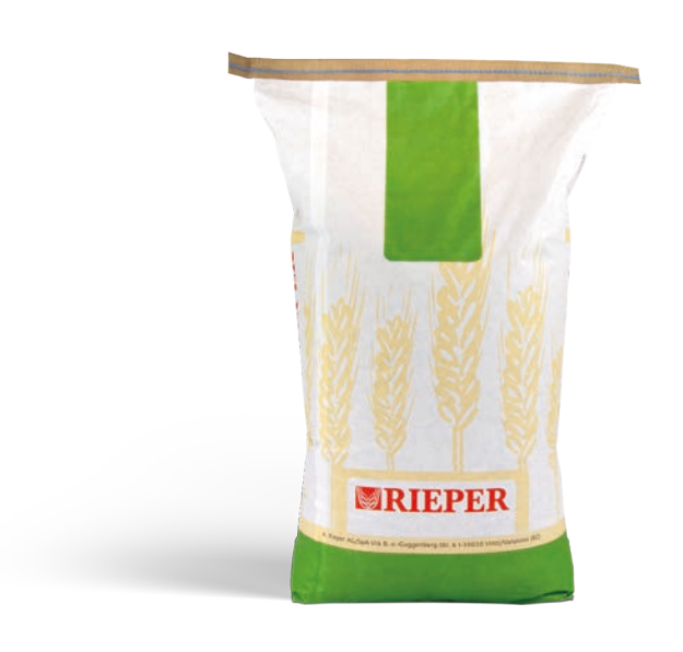
Ітем No. 0091 – 25 кg