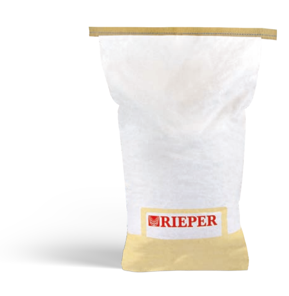
Ітем No. 1287 – 25 кg

Soft wheat flour type 00, rye malt flakes, wheat baking meal, rye baking meal, soya meal, dried natural sourdough (wholegrain rye flour, barley malt), salt, barley malt and caraway seeds.