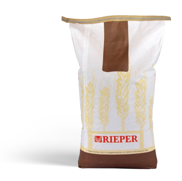
Ітем No. 1136 – 25 кg