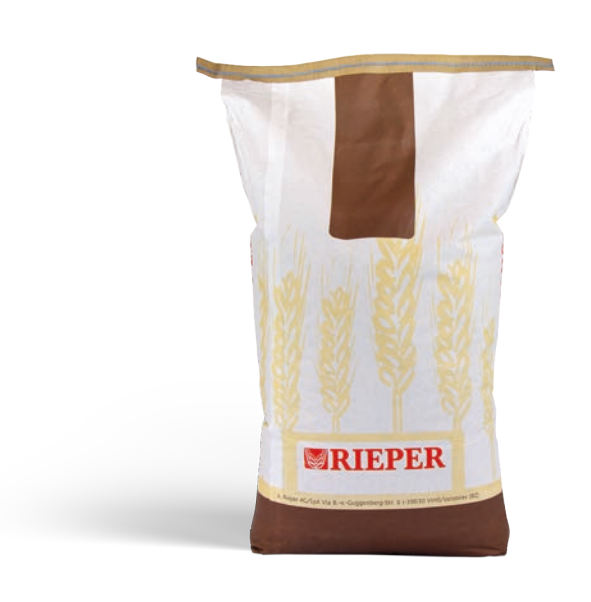
ITEM No. 0098 – 25 кg