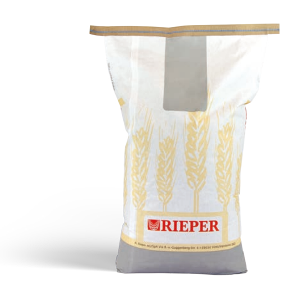
ITEM No. 1115 – 25 кg

Only selected wheat varieties from controlled organic cultivation are milled with care to produce this type of flour. Suitable for simple doughs and direct processing.