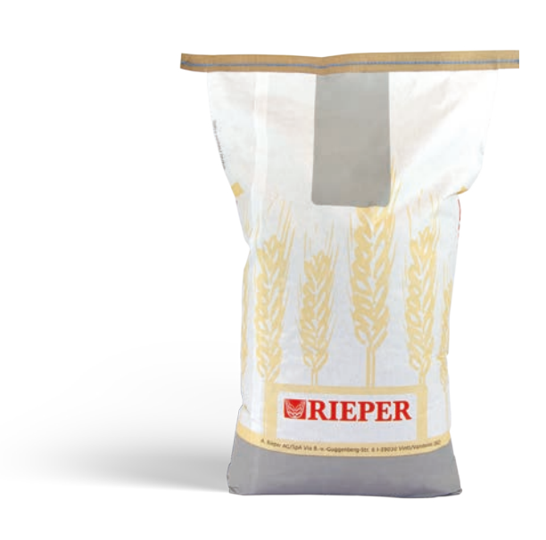
ITEM No. 0370 – 25 кg

This flour is made from a selection of European wheat varieties with low gluten characteristics and is ideal for direct processing with short rising times. In confectionery, it is particularly suitable for low-fat doughs.