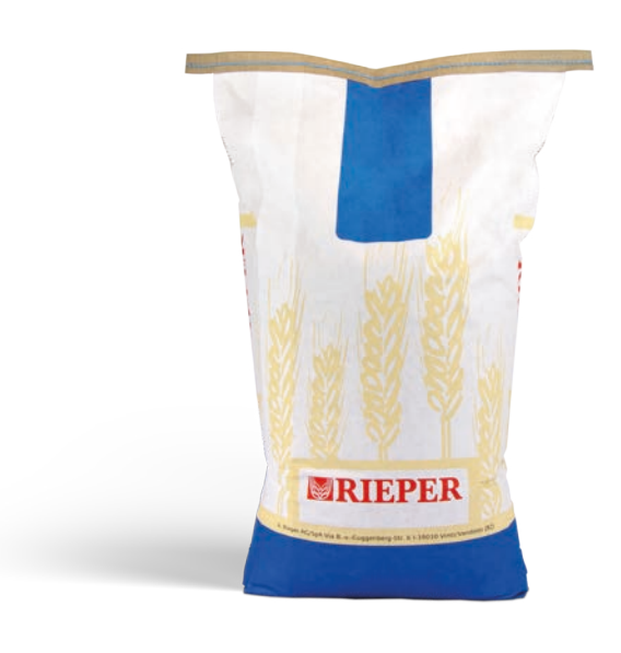
ITEM No. 0935 – 25 кg

Particular high protein levels of the best qualities make this Pizza flour the first choice for doughs with long fermentation times. The addition of durum wheat semolina gives the pizzas and focaccias a crispy crust and a soft interior at the same time.