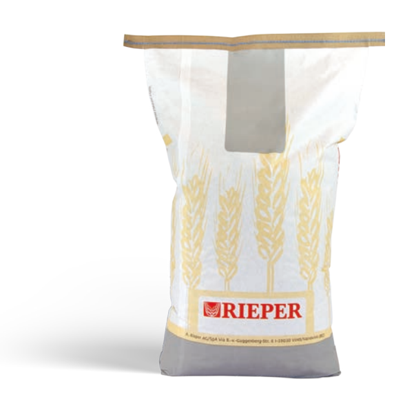
ITEM No. 0051 – 25 кg

The special composition of this flour with the highest gluten characteristics results from a blend of the best European wheat varieties. It is suitable for doughs with a particularly long leavening time as well as ciabattas and the finest confectionery such as puff pastry or panettone.