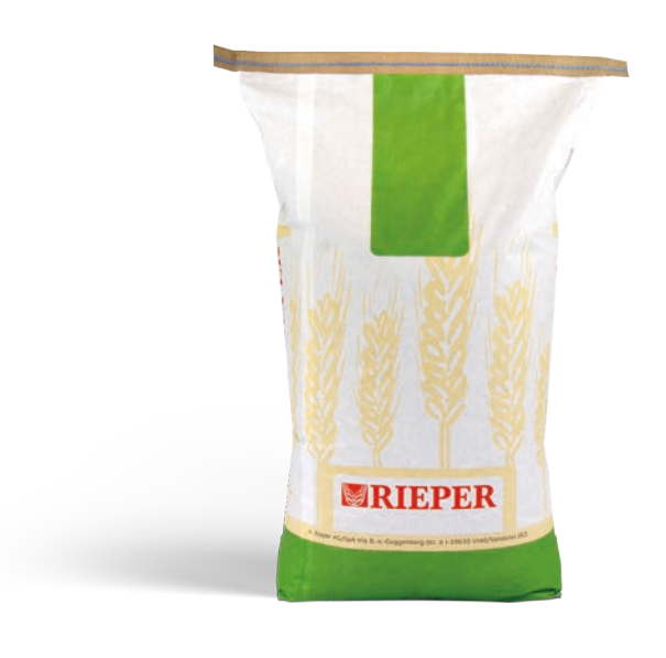
Ітем No. 0085 – 25 кg

This slightly darker type of rye flour is particularly suitable for preparing rustic, aromatic bread specialties and impresses with its nutritional values. However, it is also suitable for other rye flour recipes and for recipes in combination with soft wheat flour.