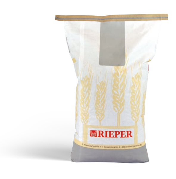
Ітем No. 0057 – 25 кg

Type 2 dark wheat flour contains a high proportion of the outer layers of the kernel and has a very high fibre content. Thanks to its fine structure, it is easy to work with and gives breads and baked goods of all kinds a strong, intense aroma and a beautiful dark colour with a rustic touch.