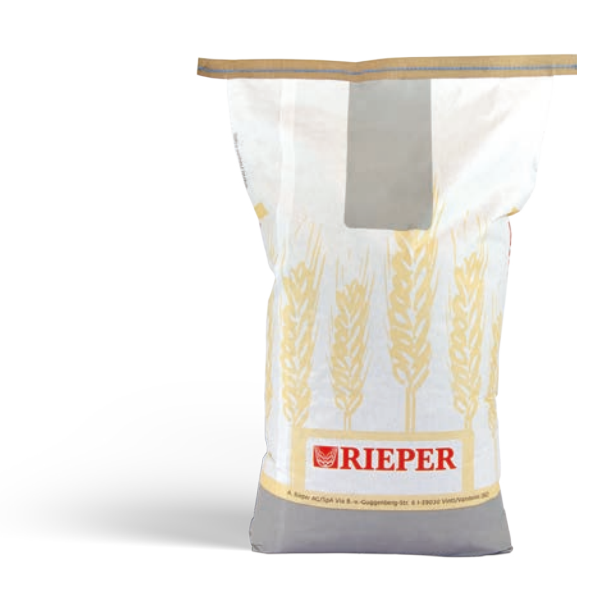
Ітем No. 0065 – 25 кg

In comparison to plain white flour, this darker soft wheat flour contains a higher proportion of the outer layers of the kernel. Therefore, it is an important source of valuable fibre and minerals in the daily diet. It is versatile in its use and gives breads and baked goods a full flavour and a slightly darker note than classic soft wheat flour.