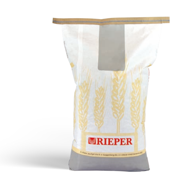
Ітем No. 0371 – 25 кg

This flour is a made selection of European wheat varieties with low gluten values. Due to the higher extraction rate, this flour is slightly darker in colour and therefore has a higher ash content. It is suitable for all direct preparation and processing methods in which fermentation stability and fermentation tolerance play a subordinate role.