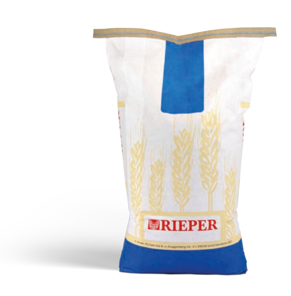
ITEM No. 0042 – 25 кg

A flour with particularly high protein values with excellent characteristics. Developed for the production of stone-baked products with long dough fermentation times. Works best for preparing traditional pizza and focaccia.