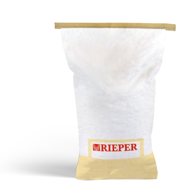
ITEM No. 1289 – 25 кG

Soft wheat flour type 2, wholegrain soft wheat flour, acidity regulator: lactic acid, L-ascorbic acid.