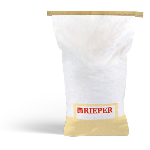
ITEM No. 0207 – 25 кg

Rye flour (62%), soft wheat flour type 0, dried natural sourdough (wholemeal rye flour, barley malt), spices.