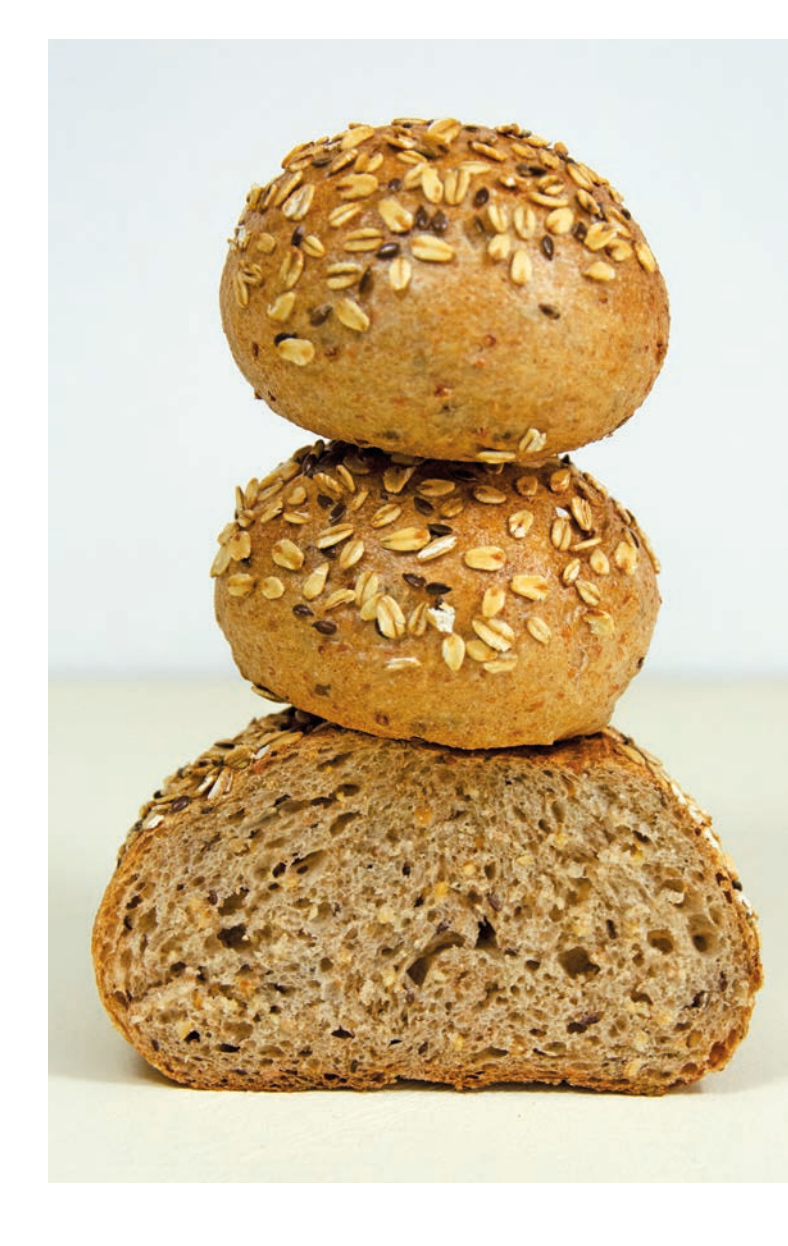
ITEM No. 0276 – 25 кg