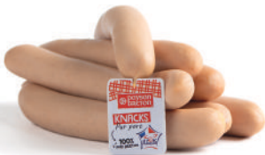
KNACKS 100% pork