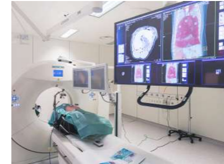
Interventional CT scanner SOMATOM Definition AS+