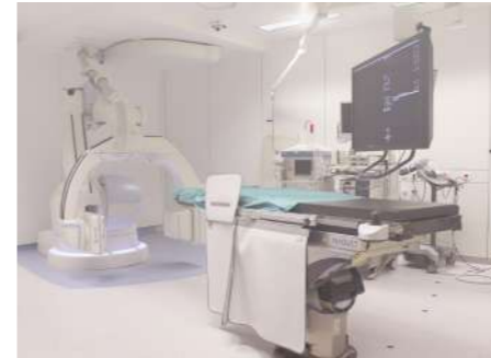
Multi-axis robotic CBCT system ARTIS ZEEGO