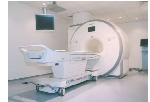
MRI 1,5T MAGNETOM AERA