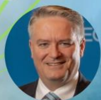
Mathias Cormann Secretary-General OECD