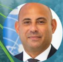
Simon Stiell Executive Secretary UNFCCC