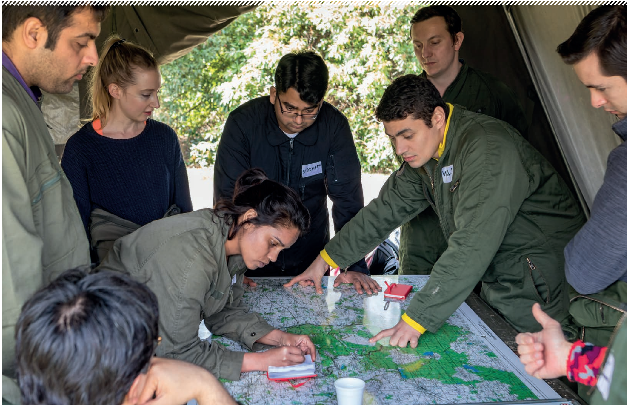
Off-campus Leadership Seminar: Leadership training requires a rigorous combination of academic theory and learning-by-doing. We teach the theories behind leadership, then provide the ideal environment to put those theories to the test.