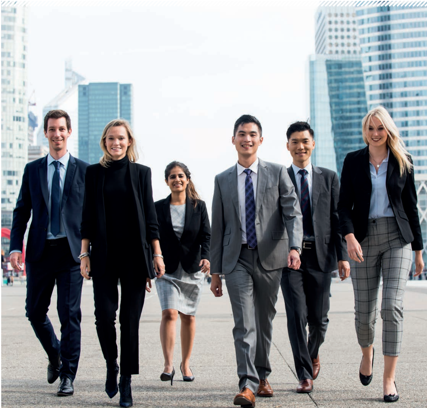
MBA students at La Défense, the largest business district in Europe and home to many of HEC Paris' corporate partners.