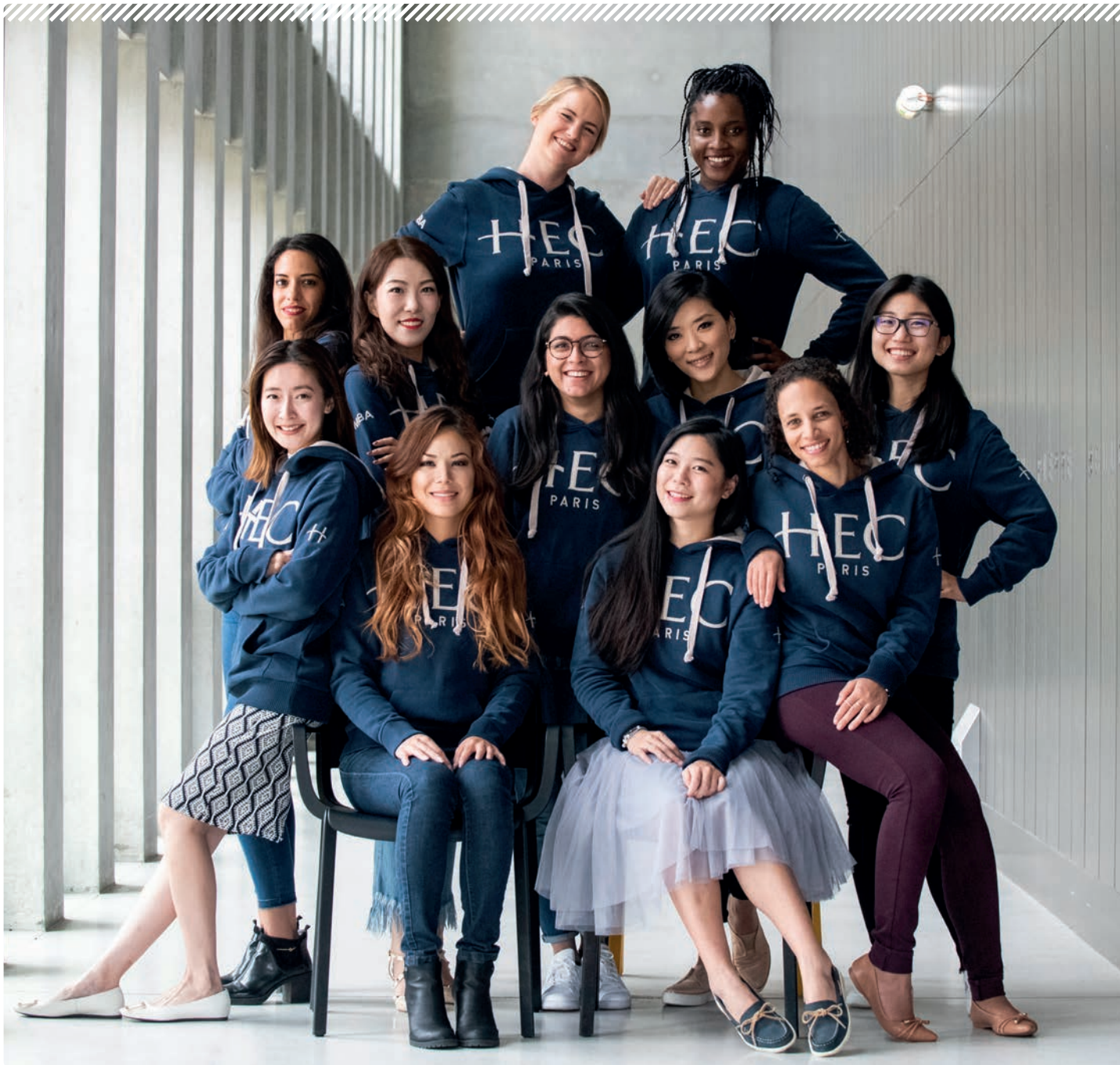
Our MBA clubs organize a wide range of on-campus speakers and workshops , including ones specifically designed to connect and empower our female students.