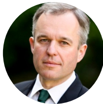
François de Rugy Strategic Advisor