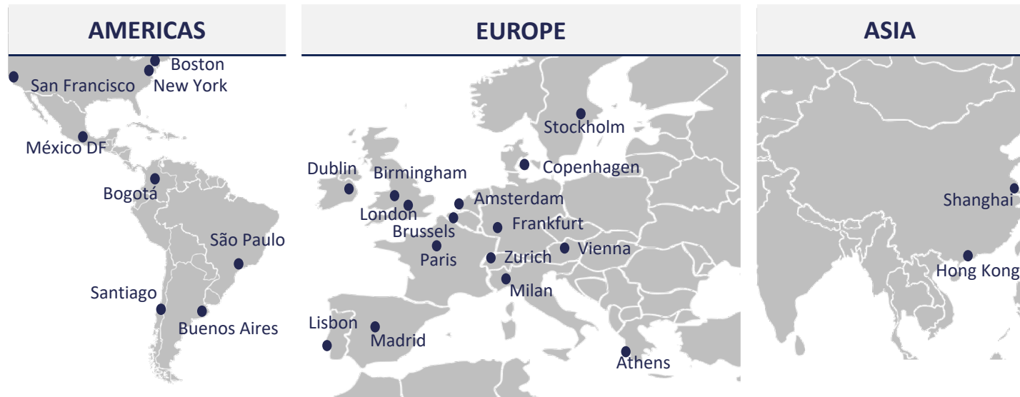
FIG M&A & Fundraising

Total team of over 150 professionals providing services to financial institutions, with a strong focus in the specialty finance / fintech sectors