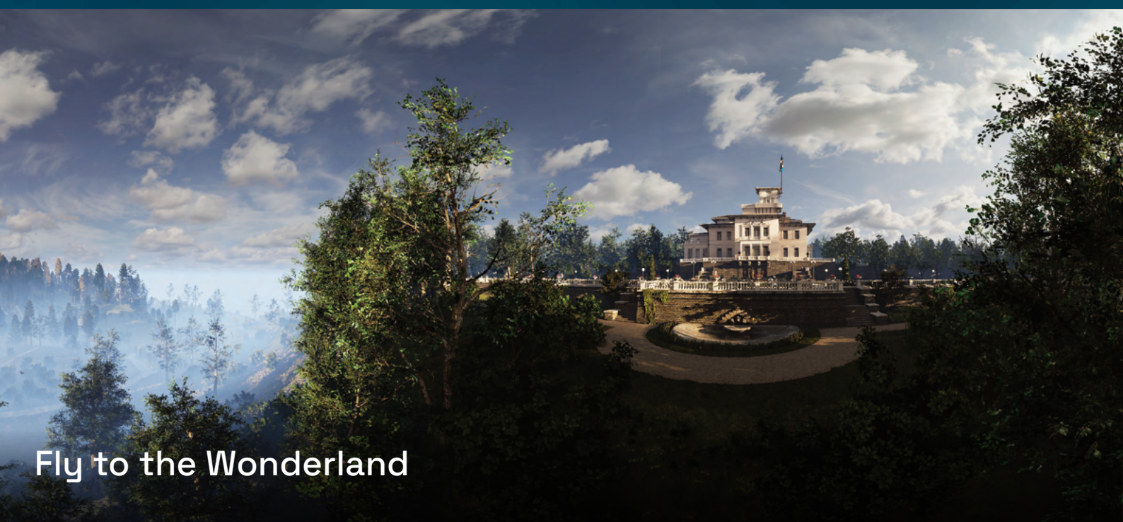
Fly to the Wonderland