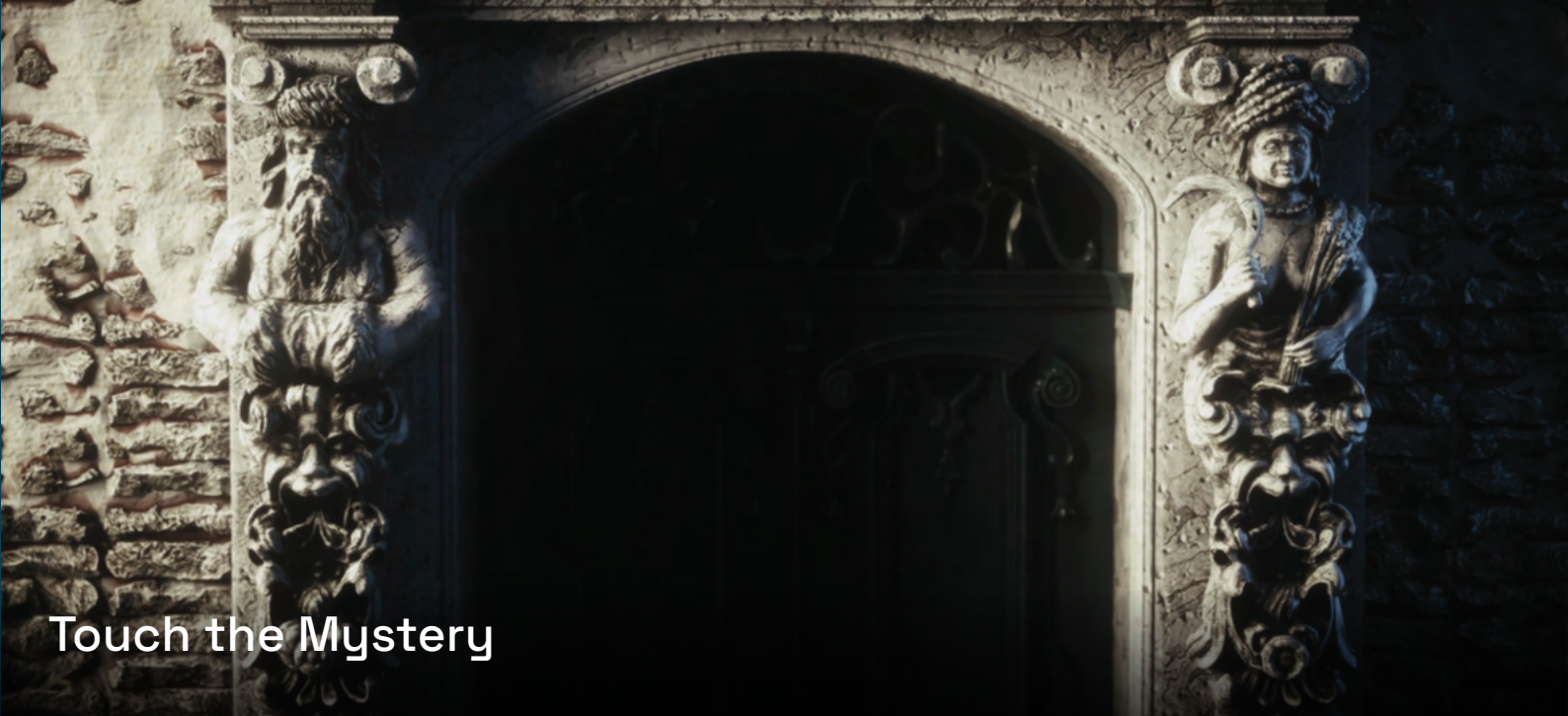
Touch the Mystery