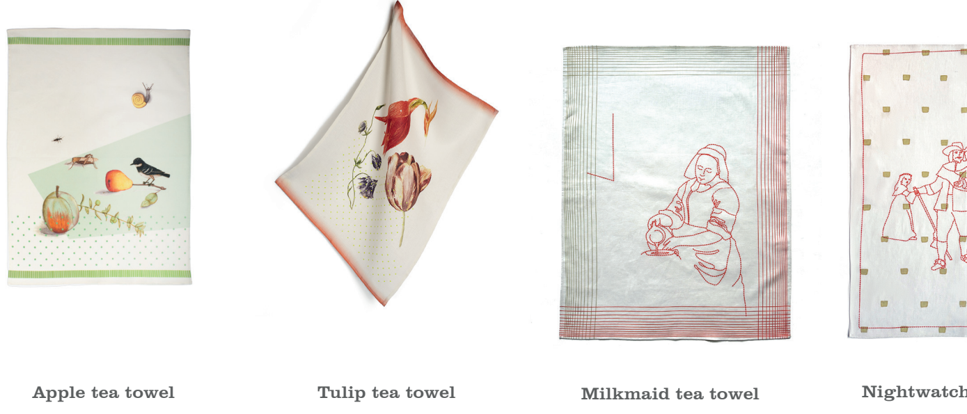
Nightwatch tea towel