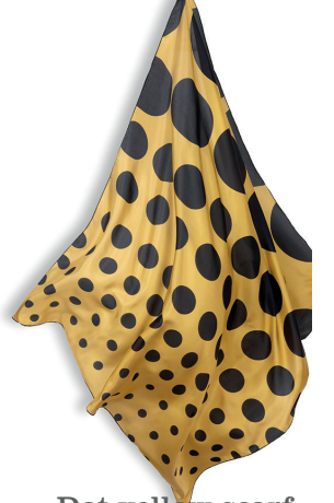
Dot yellow scarf 100% silk twill 100 x 100cm €68 - €159