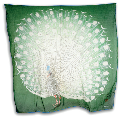
Pigeon scarf 100% cotton voile 135 x 135cm €36 - €89