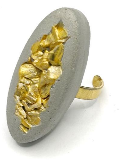
Ovale ring size M (dimensions of the plate: 4.2 x 1.8 cm): 25€

Round and rectangle earrings (diameter of the pendant: 1.5 cm ; length of the pendant : 2.6 cm): 27€ (31€ with gold-filled hooks)