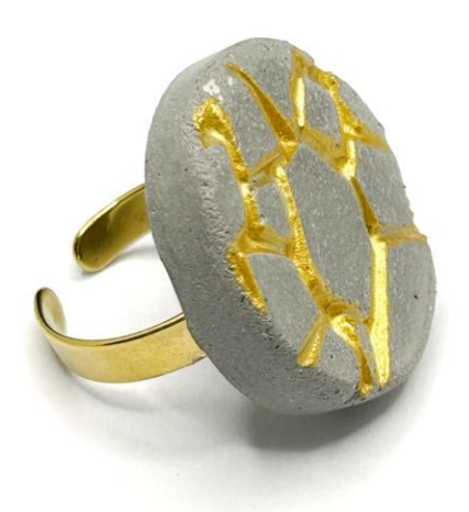
Grey and golden