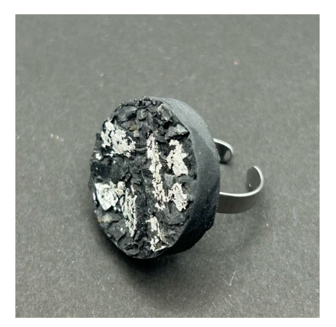
Round ring size M (diameter: 2.6 cm): 26€