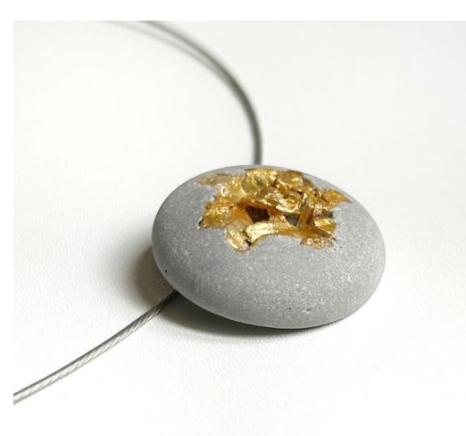
Round necklace size S (diameter of the pendant: 2.6 cm): 25€

Pebble-shapep necklace size M (diameter of the pebble: 3 cm): 25€