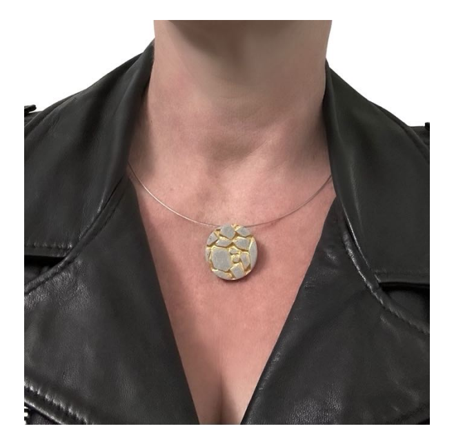
Grey and golden

Rectangles necklaces size M (dimensions of the pendants: 3.8 x 1.6 cm): 25€