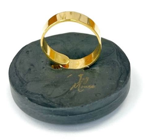
Size XL rings are adjustable and made of 24k 999/1000 flash 0.3-micron gold-plated brass.

Ear hooks are in 304 stainless steel, PVD-plated with 18k - 750/100 gold for the gold-plated ones.