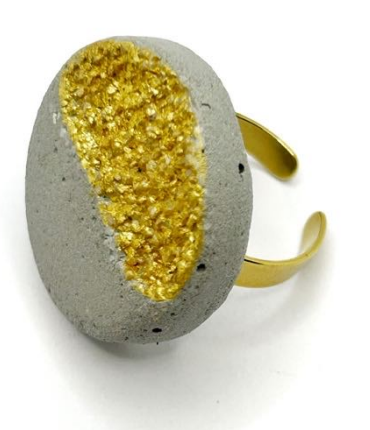
Round ring size M (diameter of the plate: 2.8 cm): 26€

Round and rectangle earrings (diameter of the pendant: 1.5 cm ; length of the pendant : 2.6 cm): 28€ (32€ with gold-filled hooks)