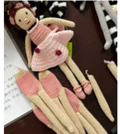
Organic Stitches Textures Handmade