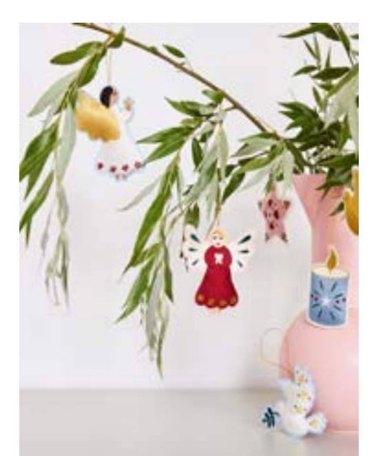
Your idea your design, our idea, our design...