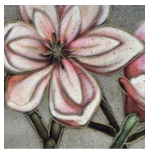
Organic Shapes Structures Species