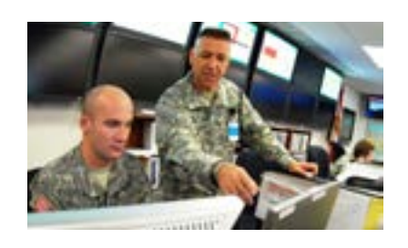
Scale & Process

ENVI Inform does the hard work for you, providing the most up-to-date information for a specific site, region, or even a global view. As new geospatial data is made available, ENVI Inform automatically retrieves, processes, and analyzes the data.