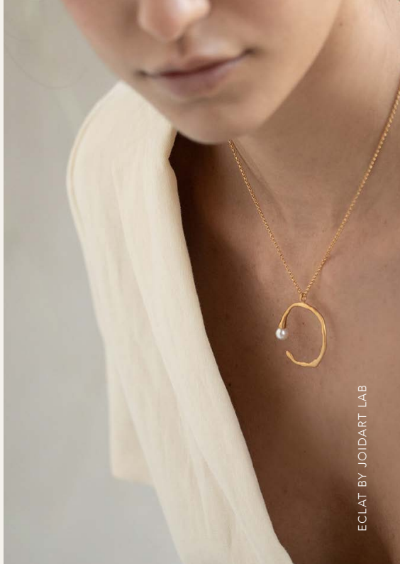
ECLAT BY JOIDART LAB

Inspired by our sea and land of internationally renowned artists, together with emerging artists and jewelers in the area, we capture the art of our Mediterranean culture and nature and transform them into minimalist, timeless design creations.