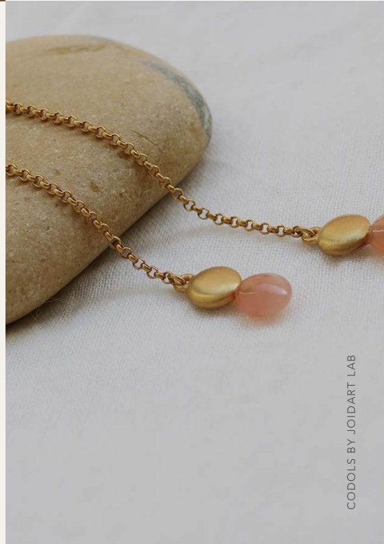
CODOLS BY JOIDART LAB