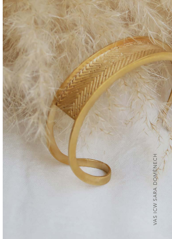
VAS ICW SARA DOMÉNECH