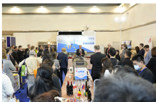
2024 European Investment Forum