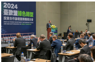
2024 EU-Taiwan Green Transition Forum