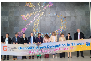
Grenoble Alpes Team (France) delegation visit to Taiwan