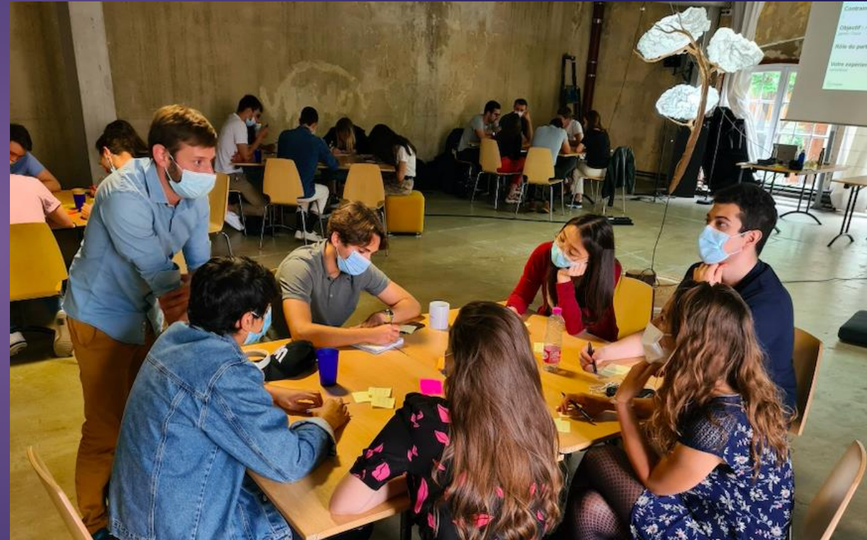
Immersion workshop with Centrale Supélec students - July 2021

3./ Studies and workshops: to better understand our existing imaginaries on a given territory, to deconstruct them in order to imagine other imaginaries and new rituals. An example of a study conducted during the SITEM in June 2022 is available here. Let's imagine new formats together, such as a listening session followed by a scientific mediation or a walk in the forest! Let's discuss it