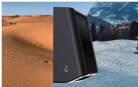
Enhanced SKU with operating temperature -30 to 80°C