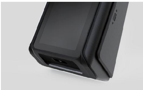
Camera for barcode scanner