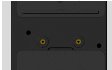
Mounting Screw Holes for Stands