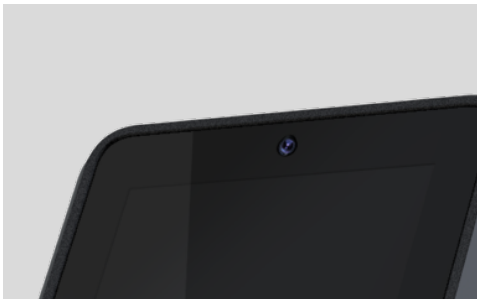
Camera for Data Capture