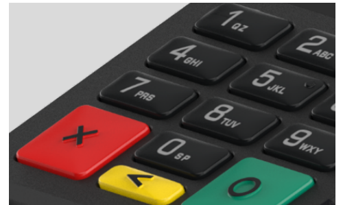
Large Backlit Keypad