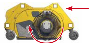
Side view of the Agri'Clean