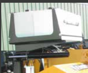
Sprinkling equipment available (optional)