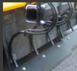
Hydraulic scraping blade: 3 sections on 2.50m sweeper, 2 sections on 2.20m sweeper