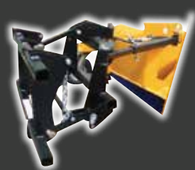
With floating design Fits to 3rd point of tractor