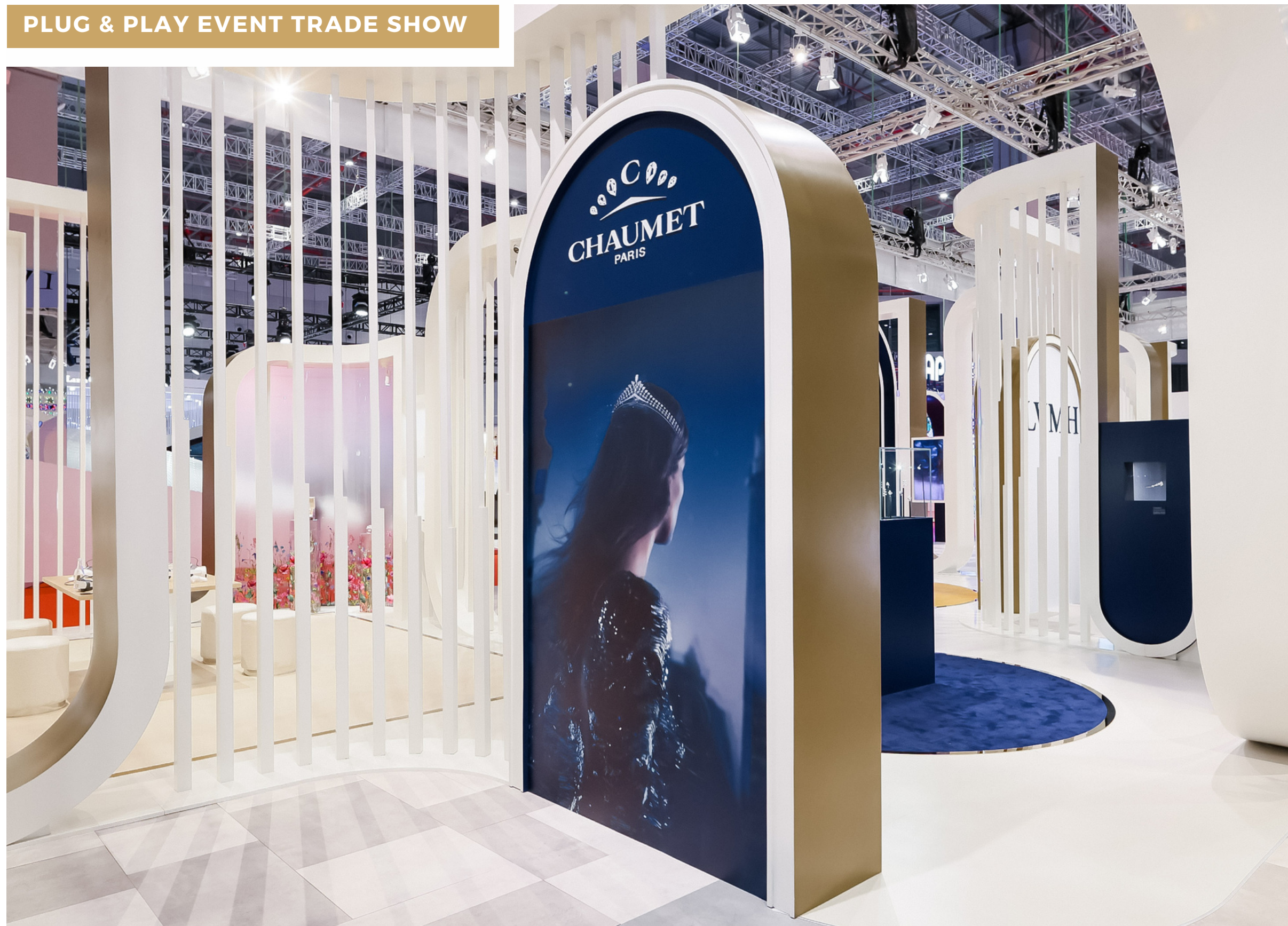
CHAUMET SHANGHAI - NOVEMBER 2022