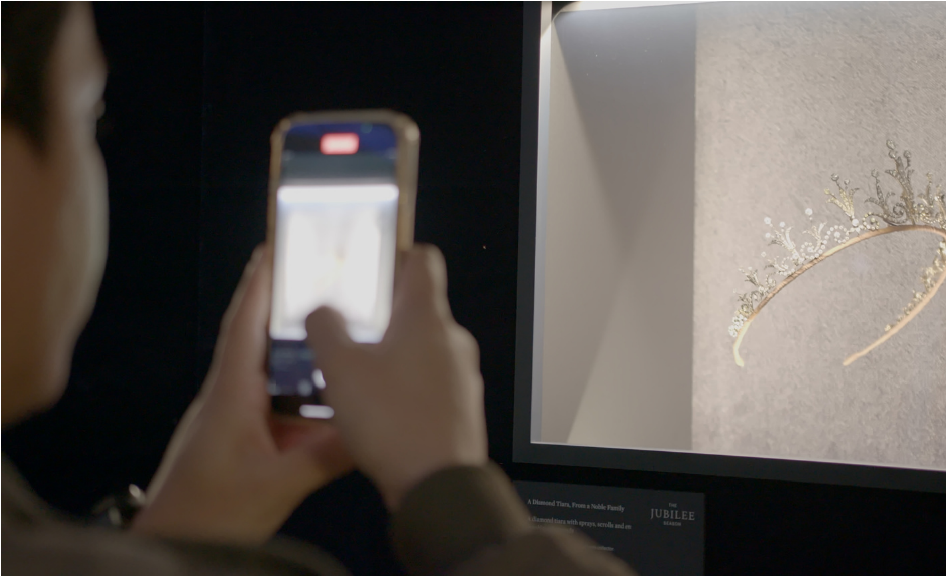
SOTHEBY'S LONDON - JUNE 2022