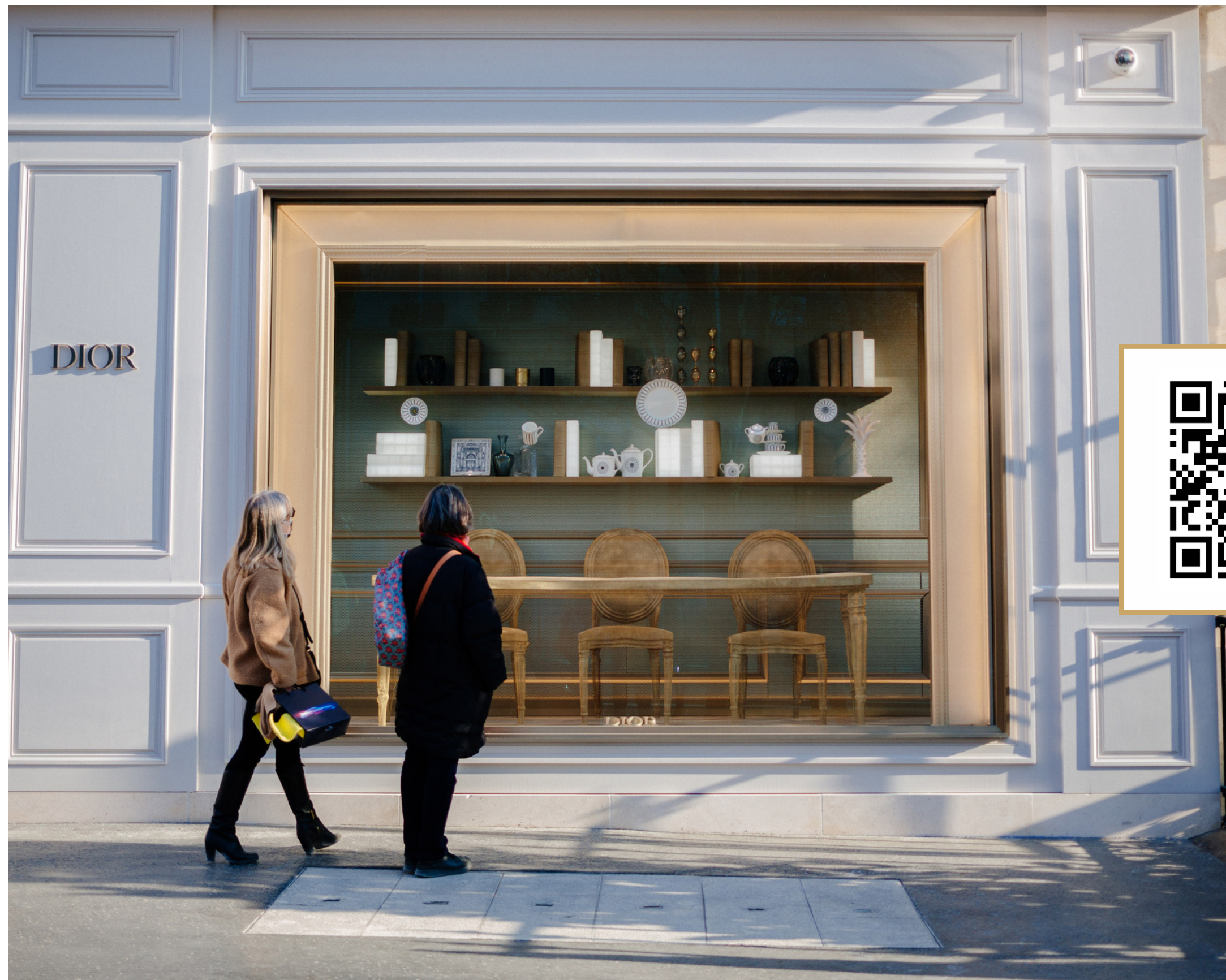
DIOR AVENUE MONTAIGNE PARIS - MARCH 2022