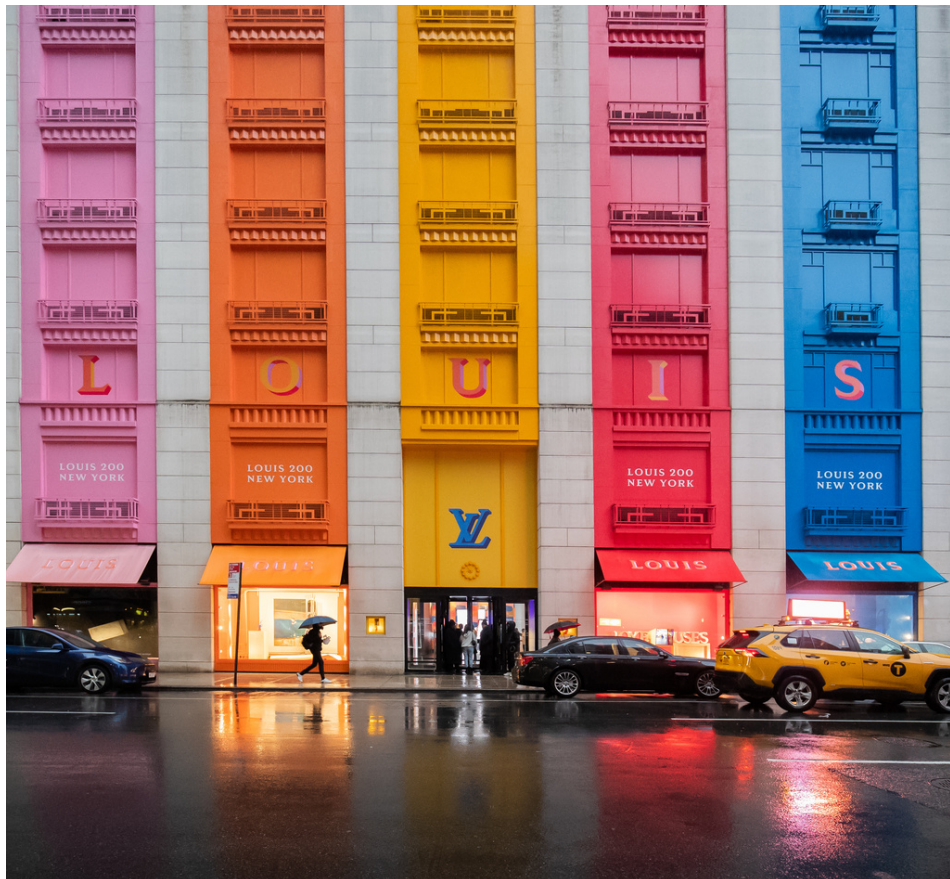
LOUIS VUITTON '200 TRUNKS' EXHIBITION NEW YORK - OCTOBER-DEC 2022