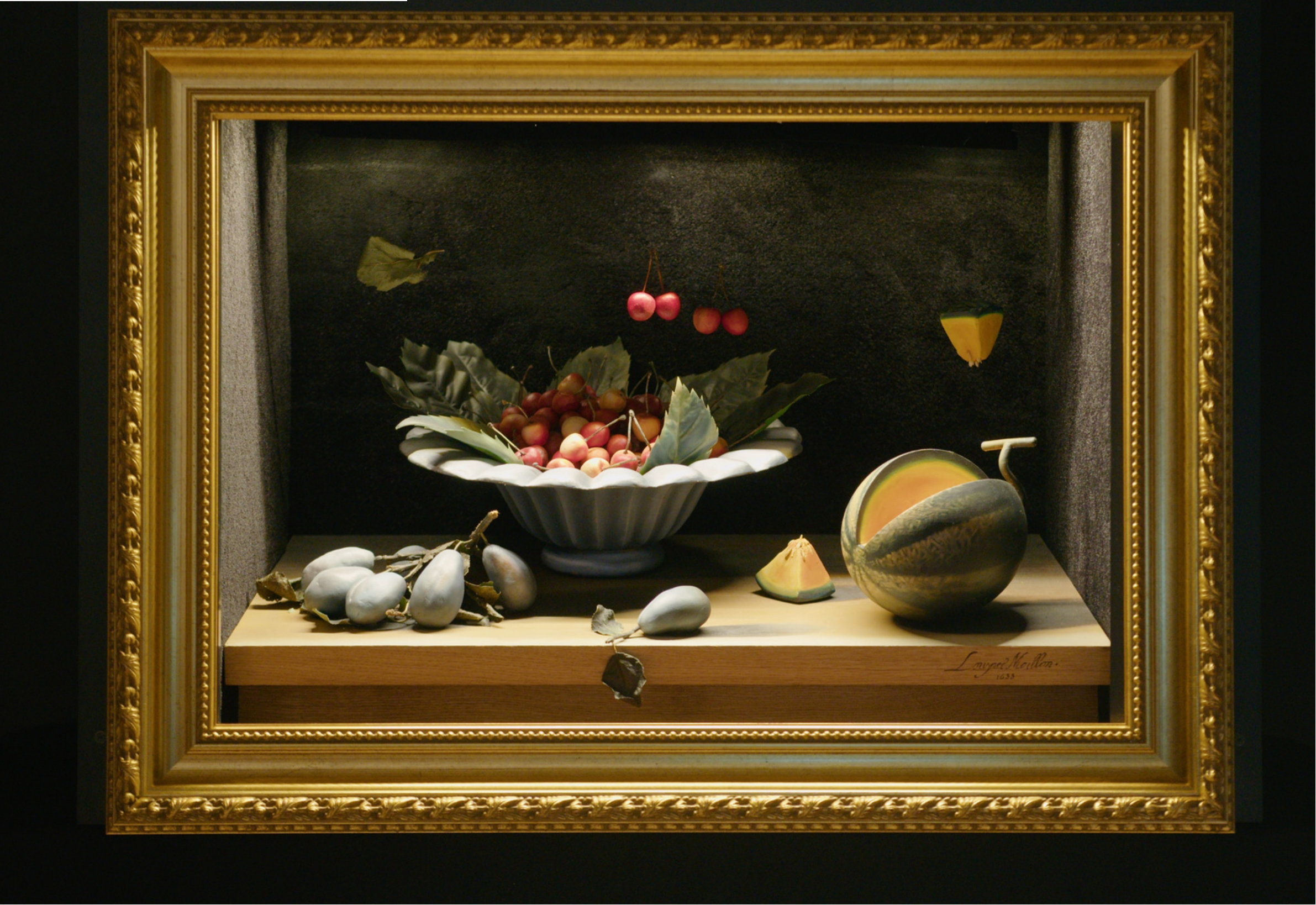
LOUVRE X ACCENTURE PARIS - NOVEMBER 2022