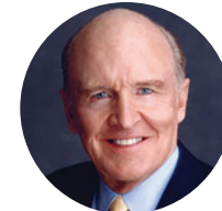
Jack Welch Former Chairman of General Electric