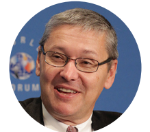
Gregory Mankiw Professor at Harvard University