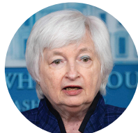
Janet L. Yellen The 78 th United States Secretary of the Treasury