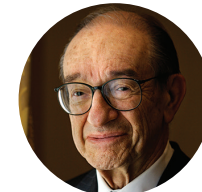
Alan Greenspan The 13 th Chairman of Federal Reserve Board