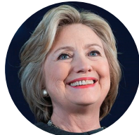
Hillary Rodham Clinton The 67 th United States Secretary of State