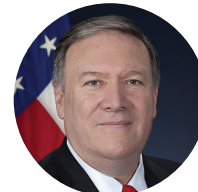
Mike Pompeo The 70 th United States Secretary of State