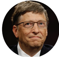
Bill Gates Co-founder of Microsoft Corporation