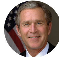
George W. Bush The 43 rd President of the United States