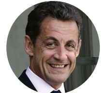
Nicolas Sarkozy The 23 rd President of France