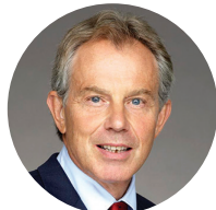
Tony Blair The 73 rd Prime Minister of United Kingdom