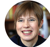
Kersti Kaljulaid The 5 th President of Estonia