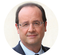
Francois Hollande The 24 th President of France