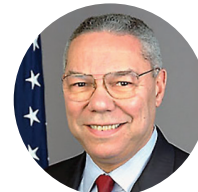
Colin Powell The 65 th United States Secretary of state