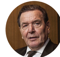
Gerhard Schröder The 7 th Chancellor of Germany