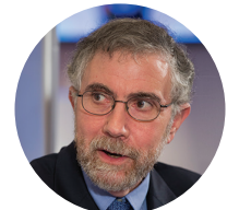
Paul Krugman Professor at City University of New York