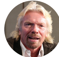
Richard Branson Founder & CEO of Virgin Group