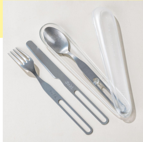
The STREET cutlery | case + fork, knife, spoon. Easy to carry and efficient