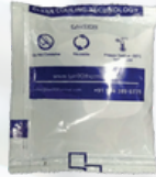
50 ml 3 * 5 inch

PCM packs are specifically designed for fast turn-around time with its rapid-charging features. They get frozen in 5 to 6 hours as compared to 18- 20 hours needed for gel pads. Available in a wide range of temperatures. Packed in Thermal sachets (flexible pack made of LDPE for single use - last mile movement) and Thermal panels (rigid long lasting - made of HDPE - mid mile movement)