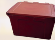
25 ltr box OD: 390 x 320 x 335 mm ID: 345 x 275 x 280 mm

*OD - Outer dimension | ID - Inner dimension