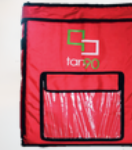
50 ltr bag 17 x 15 x 20 inch