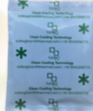
100 ml 3 * 6 inch