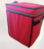
20 ltr bag 14 x 10 x 15 inch

Tan90 Bags are Custom-made for our users, they can be suited for any dimension. Flexible insulation is complemented with Tan90 panels that can be placed alongside the products, reducing costs for cold storage solution by 3 folds.