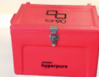
50 ltr box OD: 560 x 430 x 410 mm ID: 510 x 350 x 315 mm